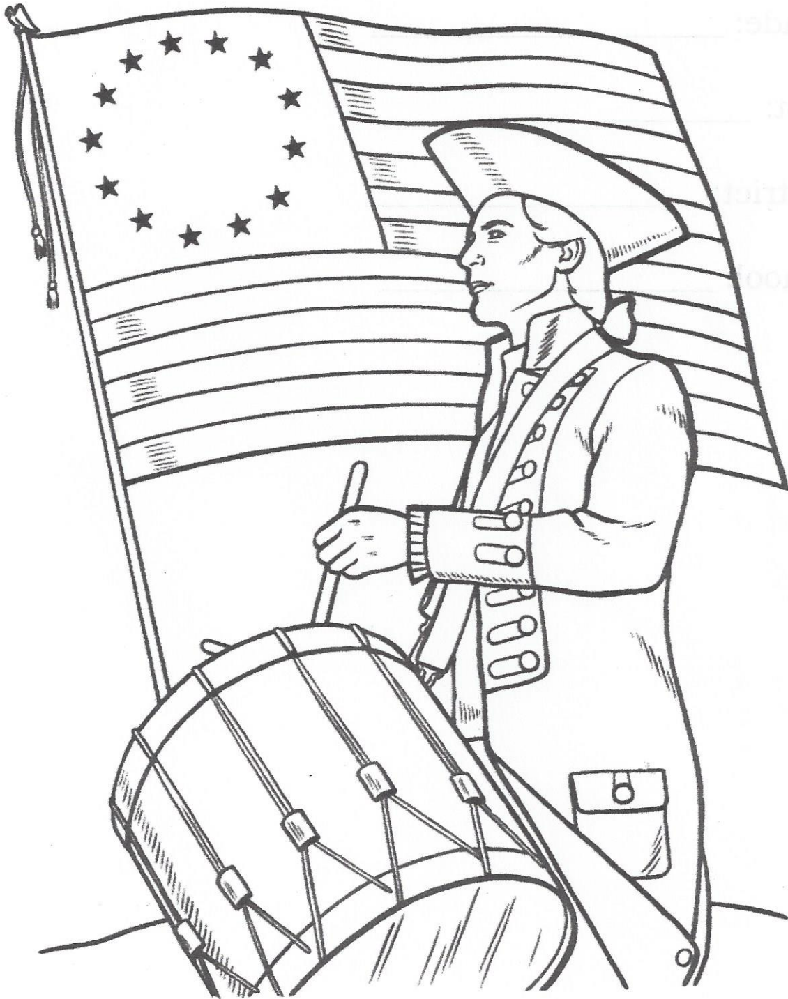
Our country's first flag.